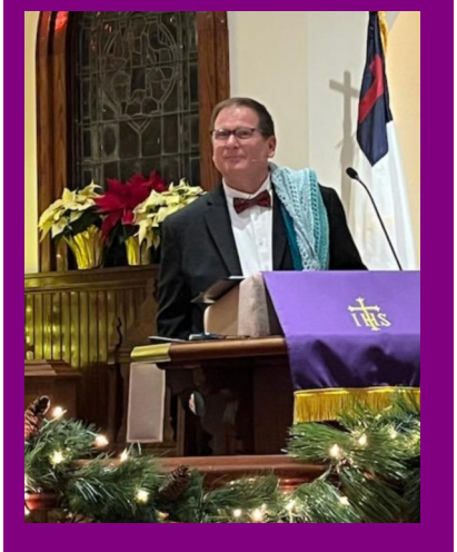
Creeker Christmas Pictures are included in this issue of the Messenger!