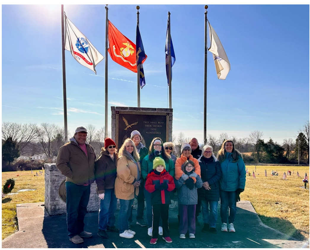
A group of Creekers went to Oak Lawn Cemetery in Gettysburg Pa to lay wreaths on the graves of American veterans on December 14, National Wreaths Across America.

TCUMC mission is to share the love of Jesus Christ with our family, our community, and our world.