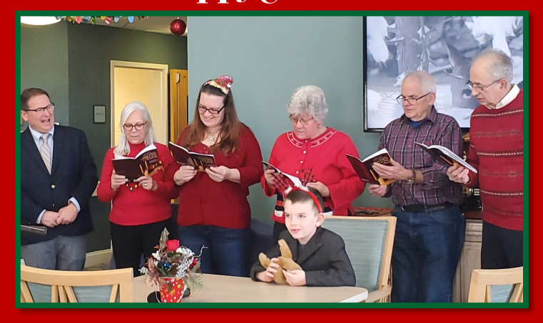
Above: Spreading the Gospel and some Christmas Cheer to folks living at Lorien.