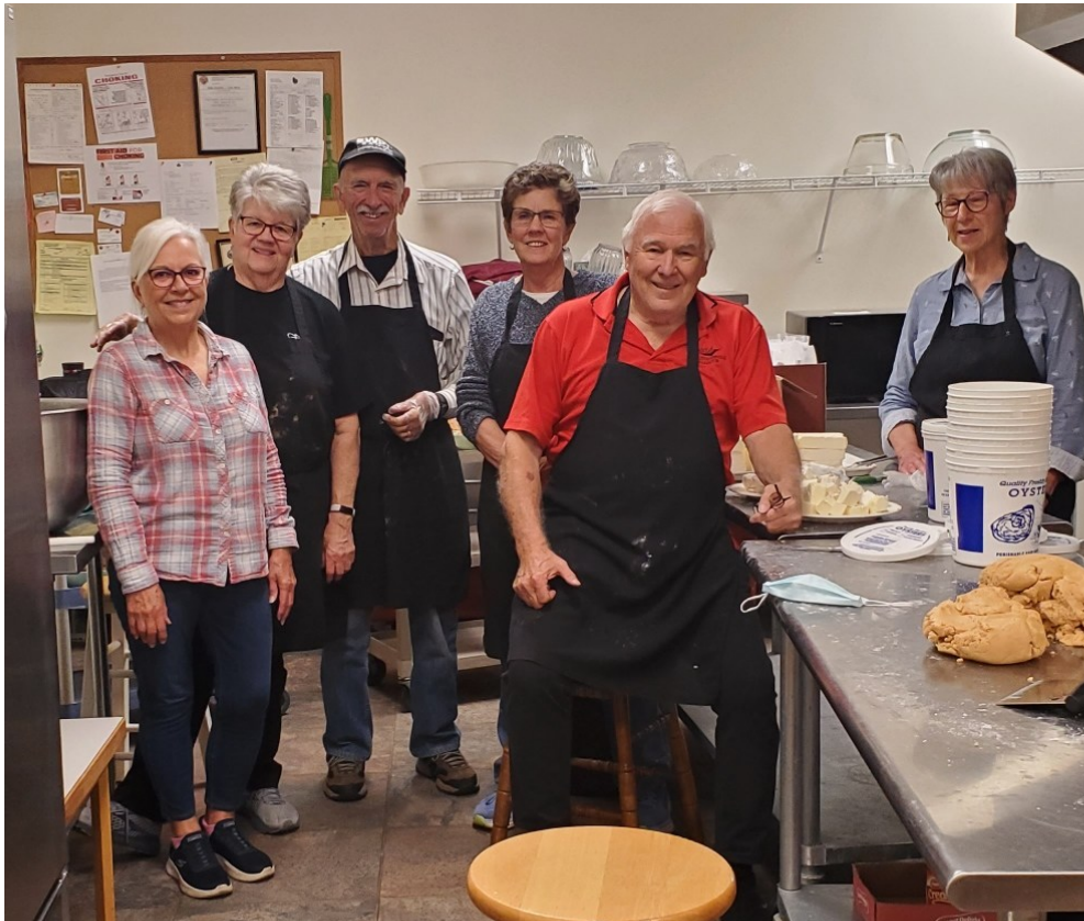
Candy Makers of the First Yule Logs of 2024

TCUMC mission is to share the love of Jesus Christ with our family, our community, and our world.